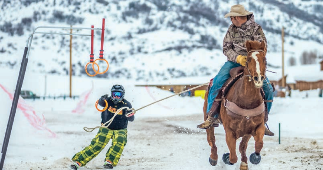
Meeker Skijor Races